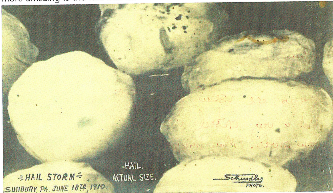
Hail Storm, 1910. 5 1/2 x 3 1/3 in.